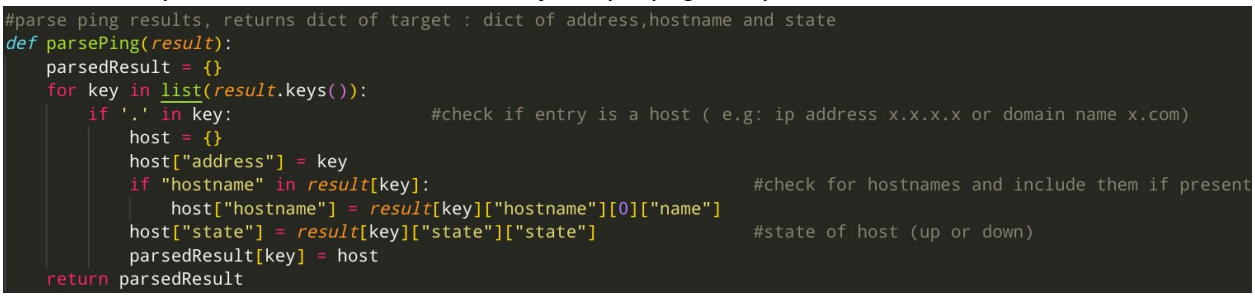
Figure 8 - Code to parse JSON result of a Nmap ping scan

Another format I have come into contact with is JSON, a data format. Due to the results of the Nmap library being returned in JSON format I've had to write parsing code so the results can be displayed to the user in a simple clean way. As JSON's data types are also present in Python—numbers, strings, booleans, arrays and objects (key-pair values like Python's dictionaries)—the functions to parse the results are relatively simple (Figure 8).